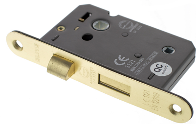
Product Finish Pictured: Satin Brass (SB)